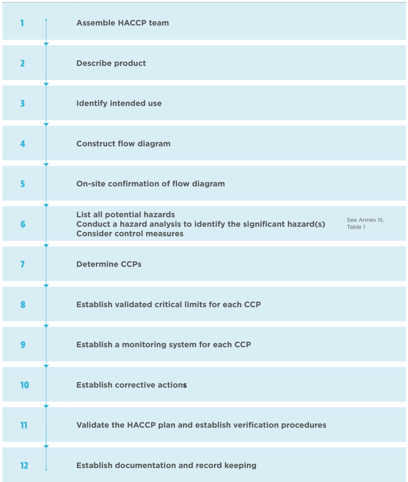
Figure 1 Logic sequence for application of HACCP